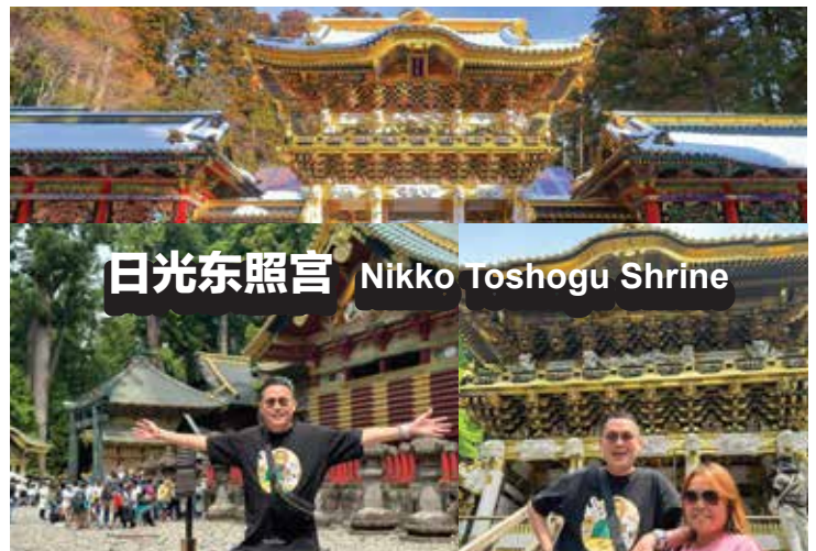
日光东照宫 Nikko Toshogu Shrine

Arrival to Kuala Lumpur, Home Sweet Home.